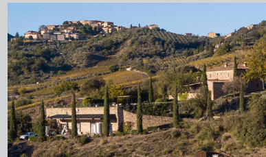
TENUTA BUON TEMPO

Click & Follow the Torre Google map for all our recommendations.